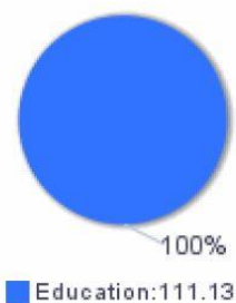
Table1: MSYs by Focus Areas